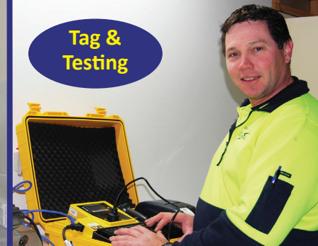
Tag & Testing